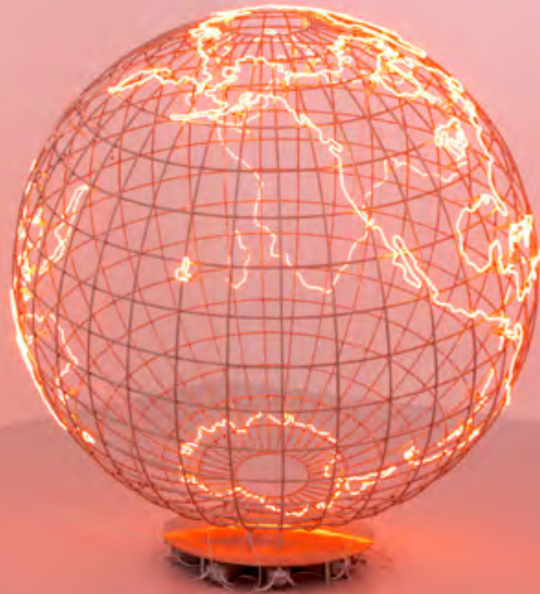
Hotspot 2013 stainless steel, neon tube 234 x 223 x 223 cm